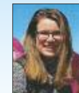
By Sydney Schwenk Western Trustee

Hello everyone, I hope you all are excited to get back into the ring as much as the AJSA Board is. This last year has sure changed our view of what normal is, but hopefully things go back to what was once viewed as a typical day.