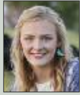
By Lauren Trauernicht North Central Trustee

We, the Nebraska Junior Simmental Association, are extremely excited to host all of you at the 2021 National Classic in Grand Island. Although things didn't go exactly as planned in 2020, we are determined to make this Classic the best that we can. With that being said, there is more to do in Grand Island than just sitting at Fonner Park all day. I have put together a list of attractions and some of the best restaurants in the area to make your time in Grand Island as enjoyable as possible.